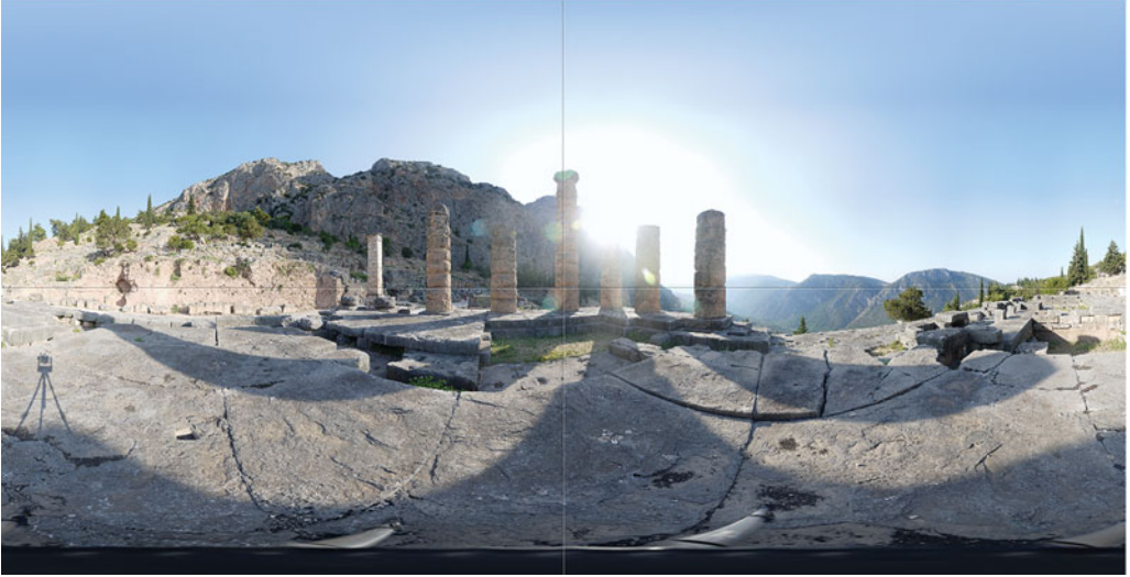
Figure 3. Stitched CAVEcam imagery from one camera of the Temple of Apollo.