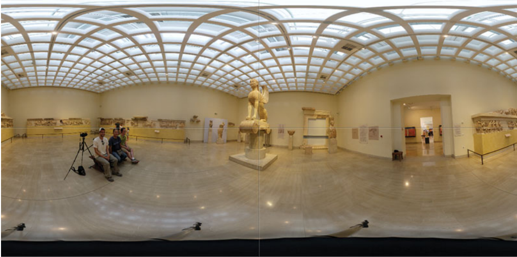
Figure 5. Stitched CAVEcam imagery from one camera of the Sphinx of Naxos.