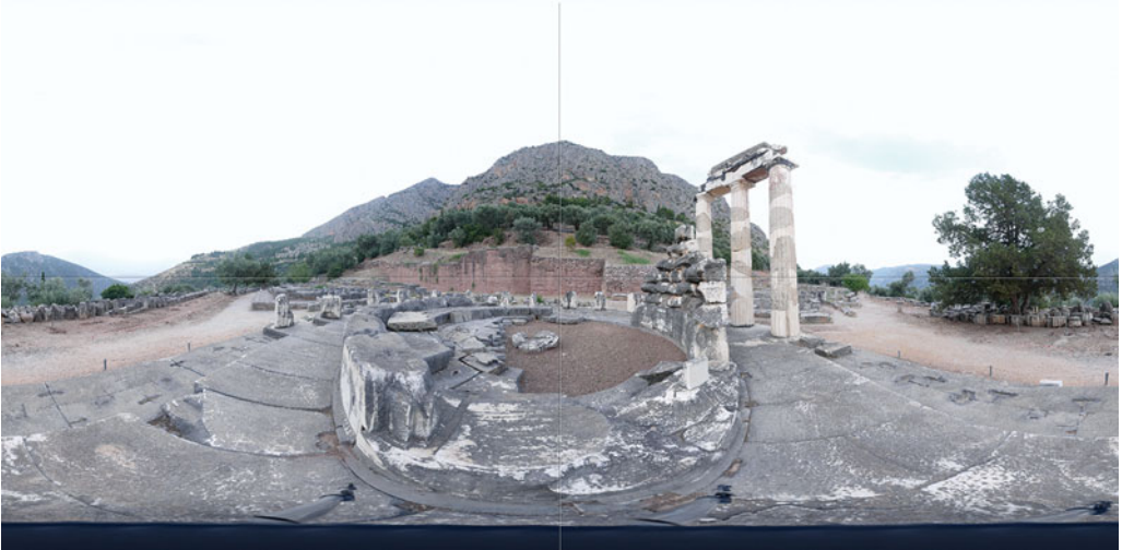
Figure 4. Stitched CAVEcam imagery from one camera of the interior of the Tholos.